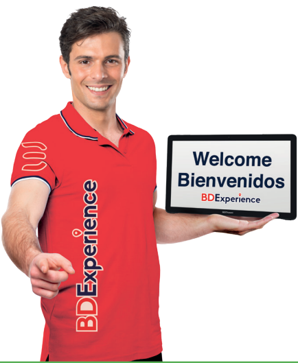
BD Experience Representative

During your trip to the welcome area, please be aware that you may encounter representatives from other companies who may try to persuade you to buy other services or to take another form of transportation. We suggest you do not purchase any of these services, if you are not interested in those services, as they are not part of BD Experience we cannot guarantee the quality and prices of services offered by third parties.