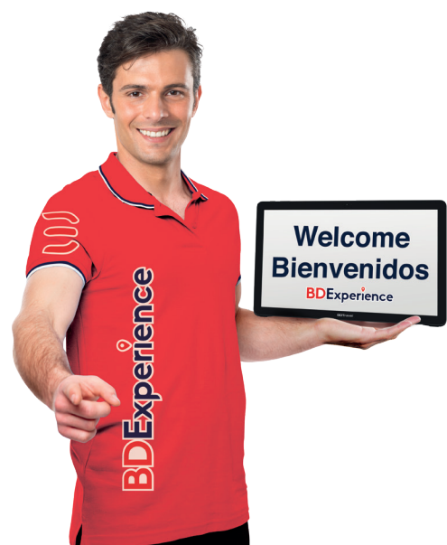
BD Experience Representative

During your trip to the welcome area, please be aware that you may encounter representatives from other companies who may try to persuade you to buy other services or to take another form of transportation. We suggest you do not purchase any of these services, if you are not interested in those services, as they are not part of BD Experience we cannot guarantee the quality and prices of services offered by third parties.