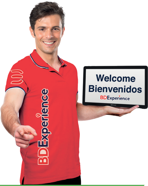
BD Experience Representative

During your trip to the welcome area, please be aware that you may encounter representatives from other companies who may try to persuade you to buy other services or to take another form of transportation. We suggest you do not purchase any of these services, if you are not interested in those services, as they are not part of BD Experience we cannot guarantee the quality and prices of services offered by third parties.